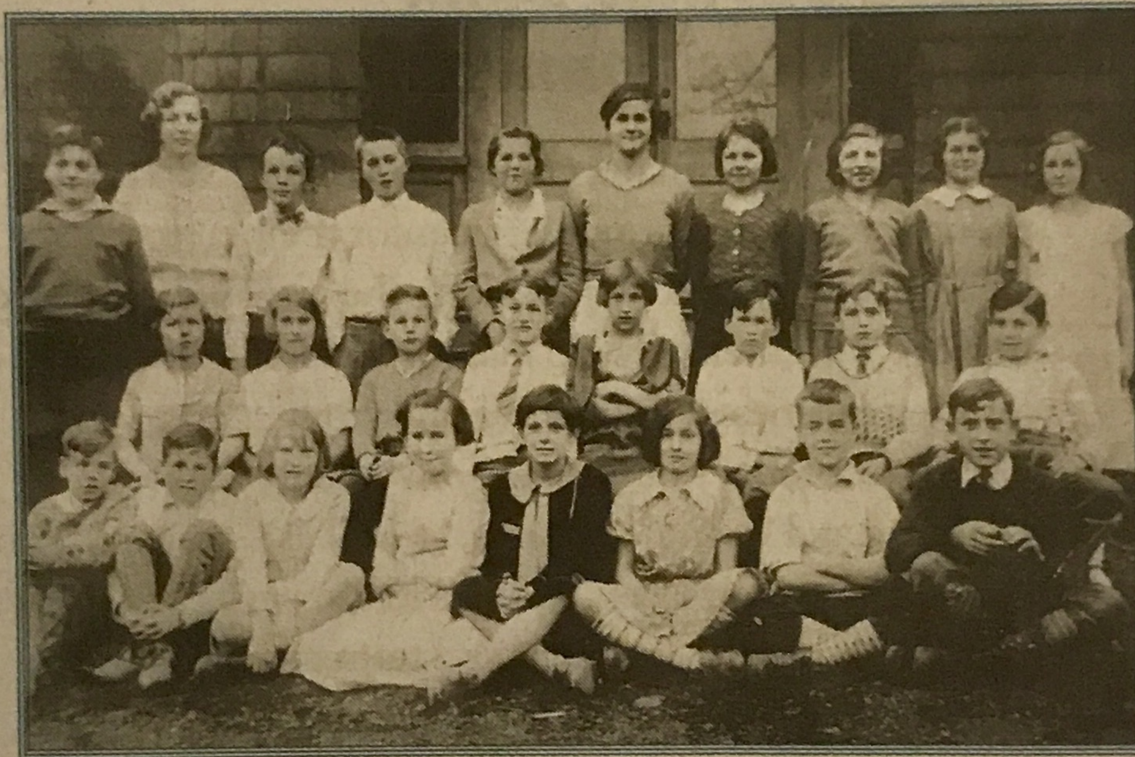
An early class photo from County Road School.